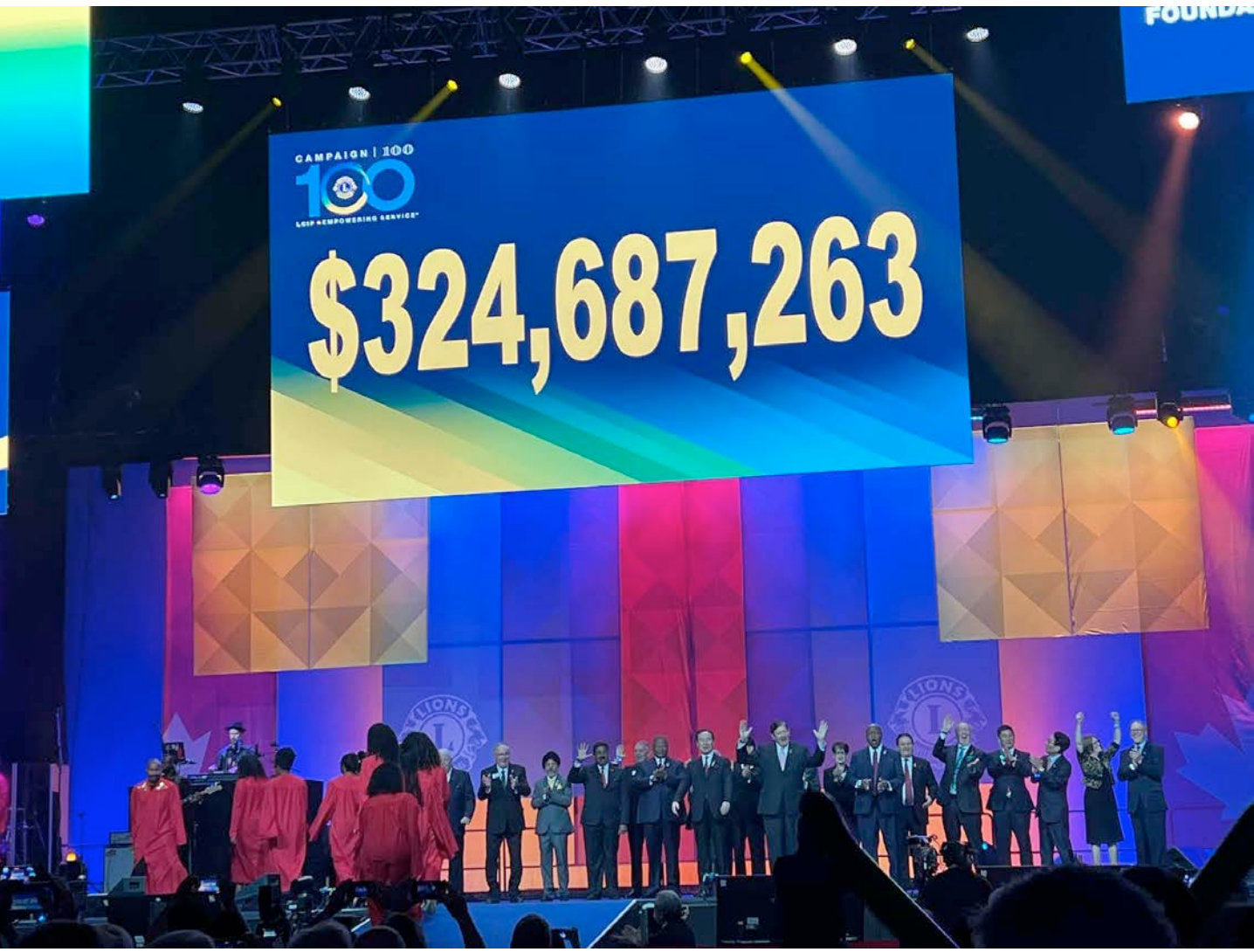
Lions around the world raised this much money during Campaign 100! Way to go Team. Together We Can.